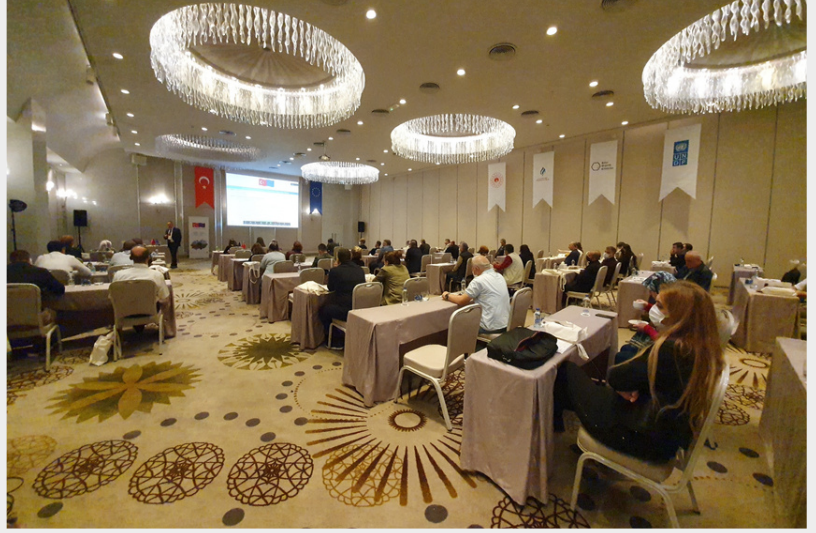
Training on Remediation Technologies and Monitoring November 2021