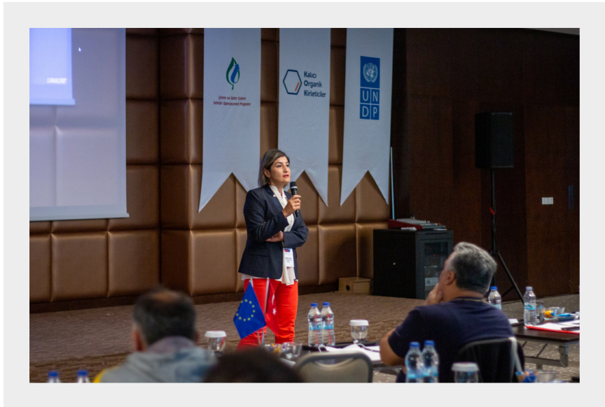
Training on Health and Ecological Risk Assessment November 2021

“Identification and Remediation of Contaminated Sites with Persistent Organic Pollutants Project” continues its capacity building trainings. Three hybrid trainings were organized with the participation of the representatives from the central and provincial directorates of the Ministry of Environment, Urbanization and Climate Change. According to pandemic measures, online participation was ensured to these trainings.