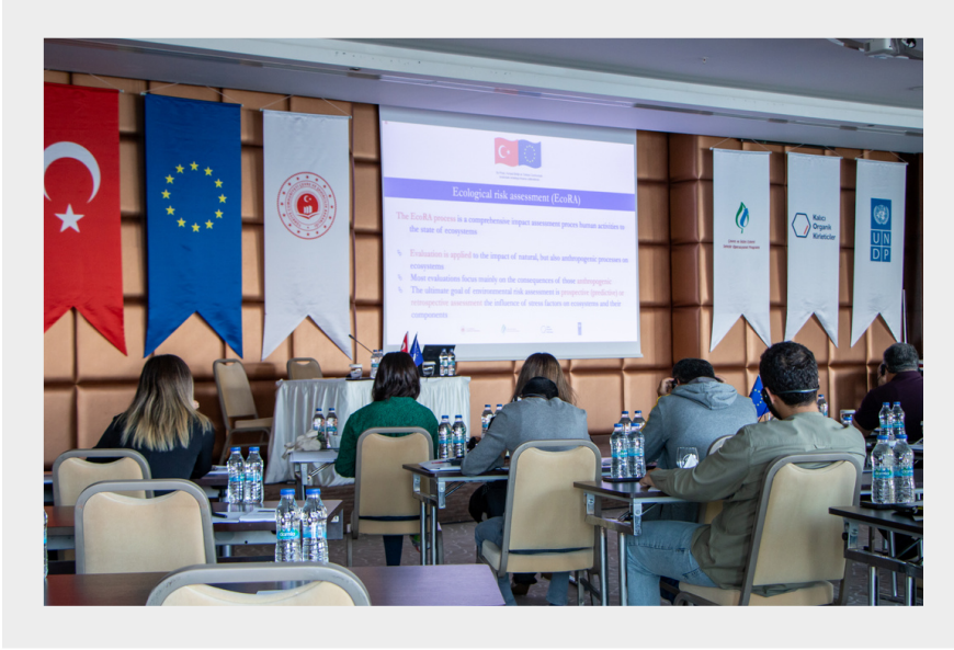
Training on Health and Ecological Risk Assessment November 2021

Training on Health and Ecological Risk Assessment, which focused on the cancer and ecological risk assessment in the polluted areas, was organized between the dates of 11-13 October and 1-3 November. Through these trainings, approximately 120 participants were informed about the cancer risk assessment methods.