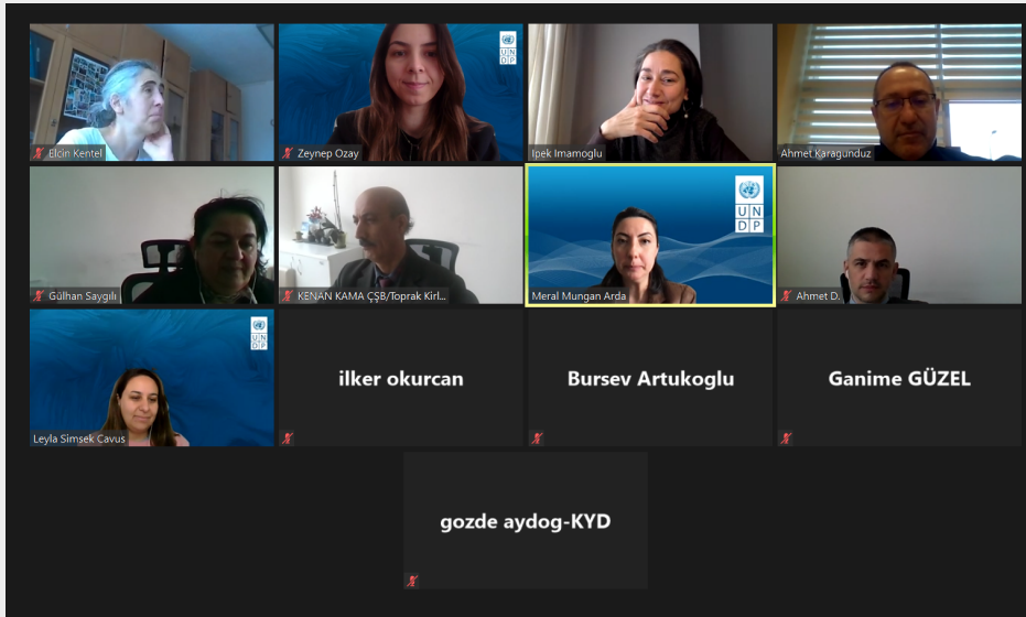
26 March 2021, video conference