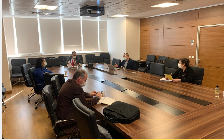
3 March 2021, MoEU meeting room

Two separate meetings were held on 1 March 2021 and 26 March 2021 with project's technical consultants and the Beneficiary in order to define a roadmap for changes to be made in the "Regulation on Control of Soil Pollution and Sites Contaminated by Point Sources". The studies are initiated for the implementation of work packages in line with the meeting decisions.